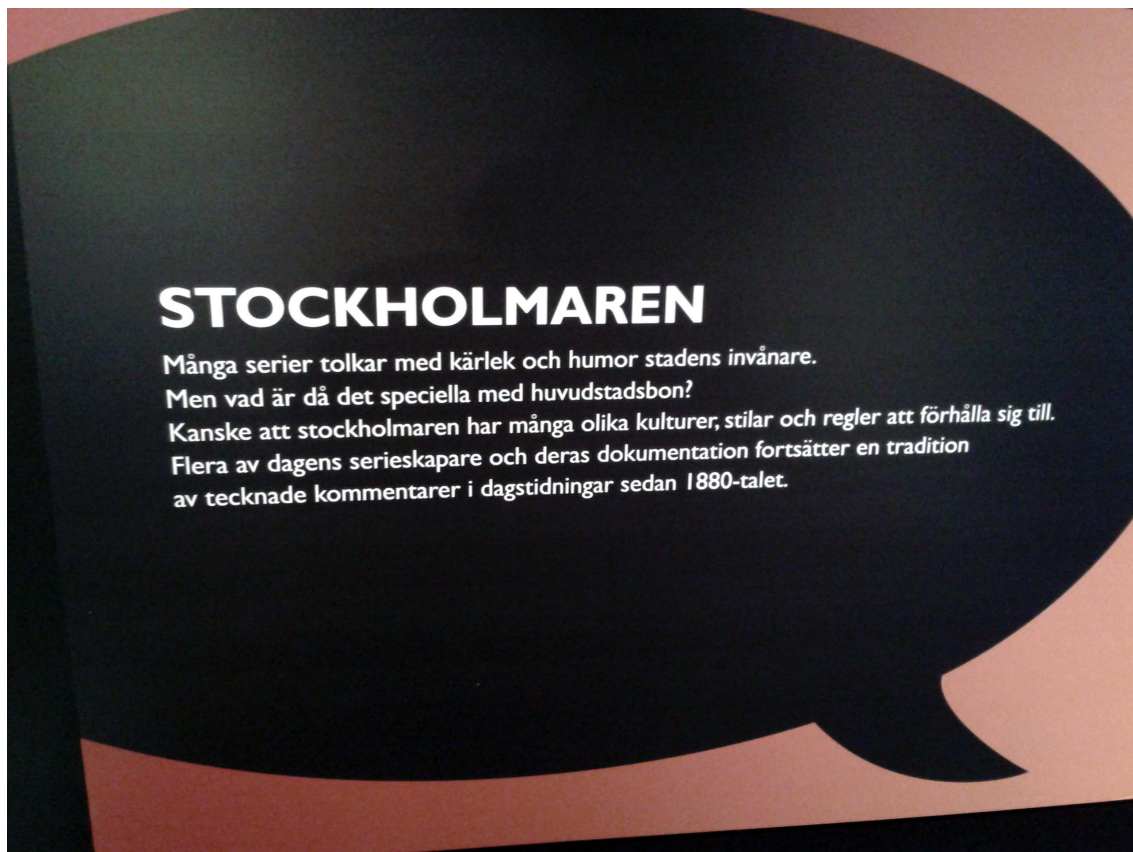
Figure 3. The Stockholmer.

For example, for ‘Comics as a Time Machine,’ the images ranged across different decades of the 20 th and 21 st centuries. The placard for this theme cites ‘a Stockholm that no longer exists,’ when the neighborhood near Stockholm Cathedral consisted mostly of old houses rather than the modern urbanscape that exists in the 21 st century.