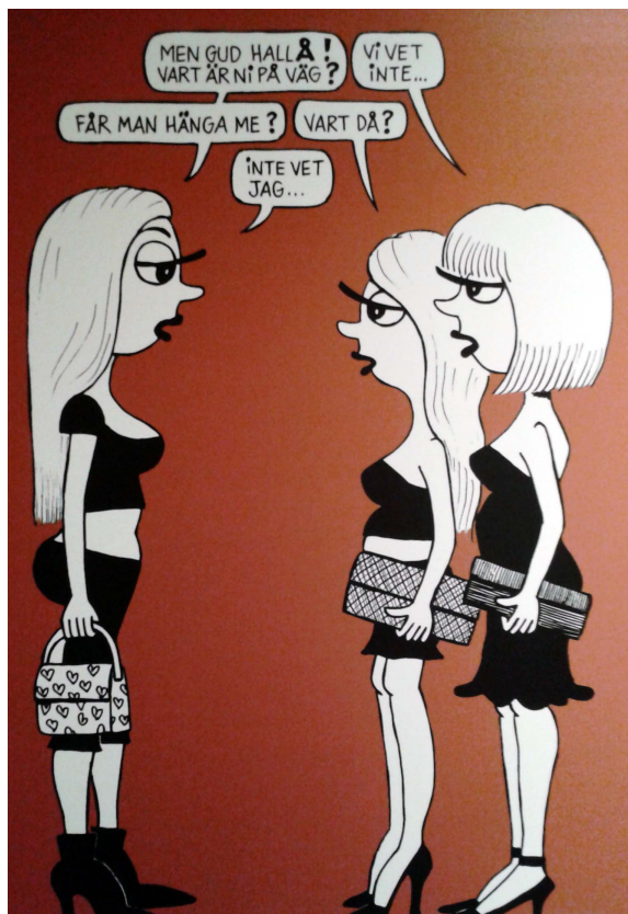
Figure 4. Three female characters from Lena Ackebo's FUCKING SOFO .

Several images were enlarged and put directly on the walls of the museum, ranging from full comic strips to excerpts from comic books. These enlargements were beautifully designed, arranged on the walls in highly readable fashion.