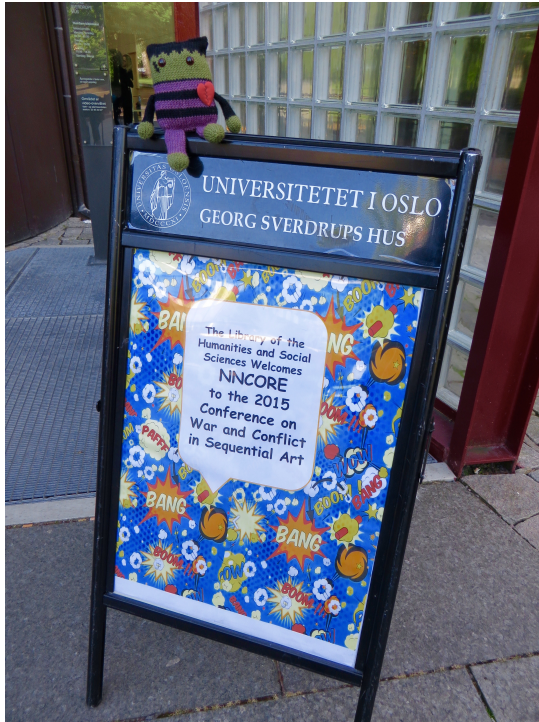
Image 1. The University of Oslo welcomed comics scholars to the conference (with a bang)!