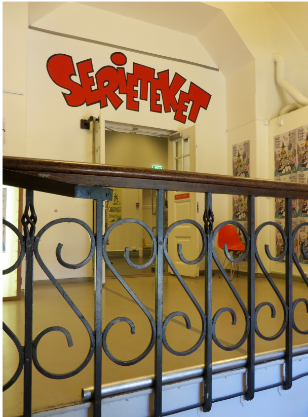
Image 6. Open doors invite the visitors to get lost in the Serieteket.

genres. Racks of local zines give way to shelves upon shelves of Vertigo, superhero, and horror comics, and in the corners, little storage cupboards are stuffed with manga and Disney. With the collection of approximately 10,000 titles and a multitude of cozy little corners to indulge in them, Oslo's Serieteket could only be described as a piece of heaven for comic book scholars and hobbyists.