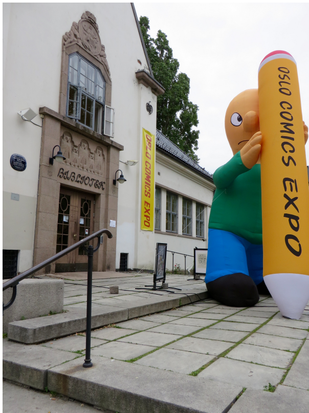
Image 5. The Oslo Comic Expo took place in the neighbourhood of Grünerlokka.